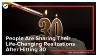
People Are Sharing Their Life-Changing Realizations After Hitting 30