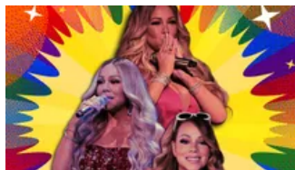
Why Queer Men Of Color Love Mariah Carey So Hard